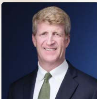
The Hon. Patrick J. Kennedy The Kennedy Forum Recipient of the 2025 STAR NeuroLeadership Award